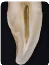
Prof. Marleen Peumans (Belgium)

Traditional shade systems rely on different hues (colours), known as A, B, C and D. However, it is known that enamel and dentin have different characteristics , both contributing to the final shade perception of teeth. By breaking away from traditional monochromatic shades and focusing on reproducing the characteristics of enamel and dentin , you can obtain a much more natural result in just two simple layers.